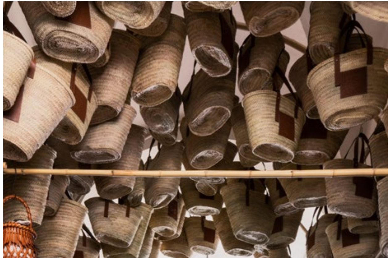
LOEWE Baskets at Salone del Mobile Milan 2019