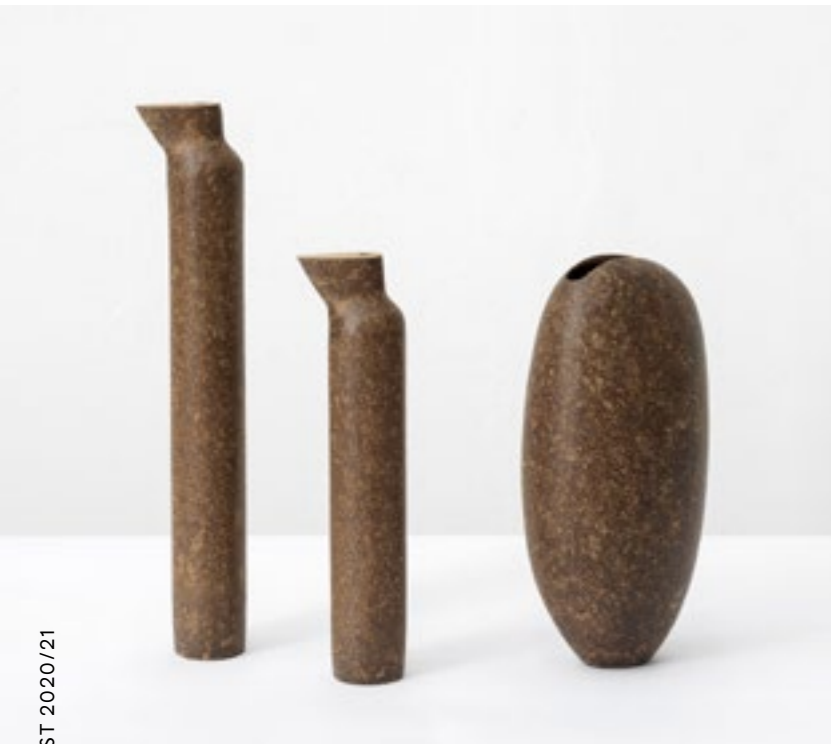
Mantiqueira vases by Tacchini