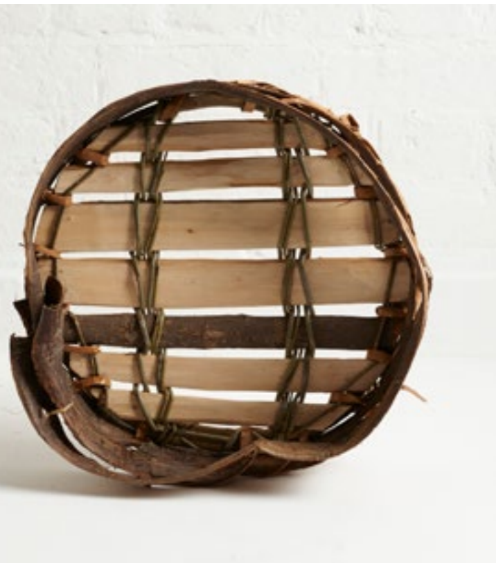
Basket by Hilary Burns