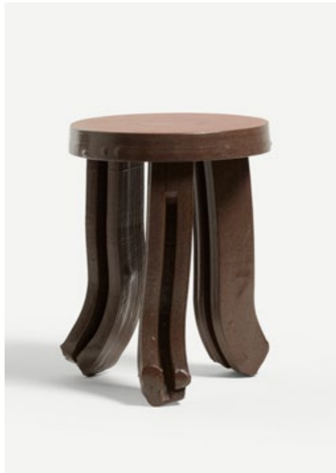
Side Table by Joe Hartley, image courtesy of The New Craftsmen