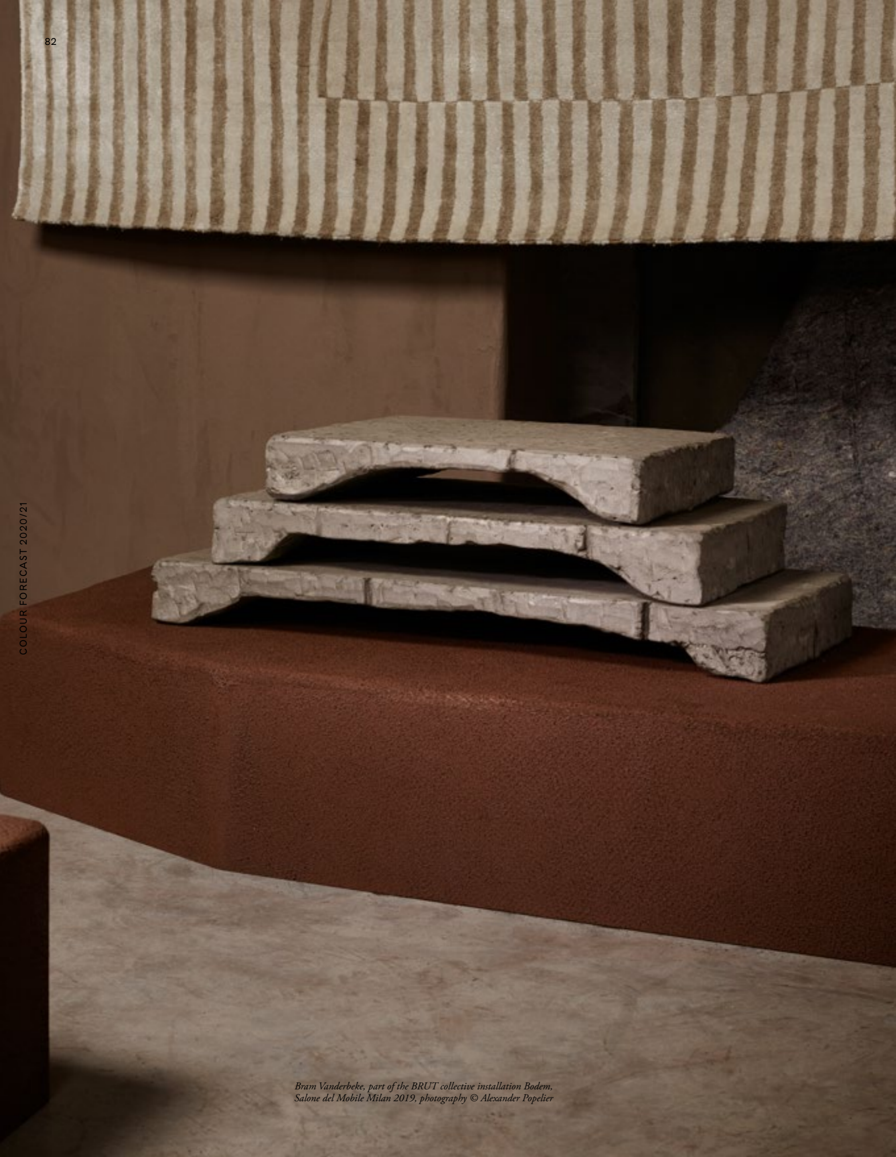
Bram Vanderbeke, part of the BRUT collective installation Bodem, Salone del Mobile Milan 2019