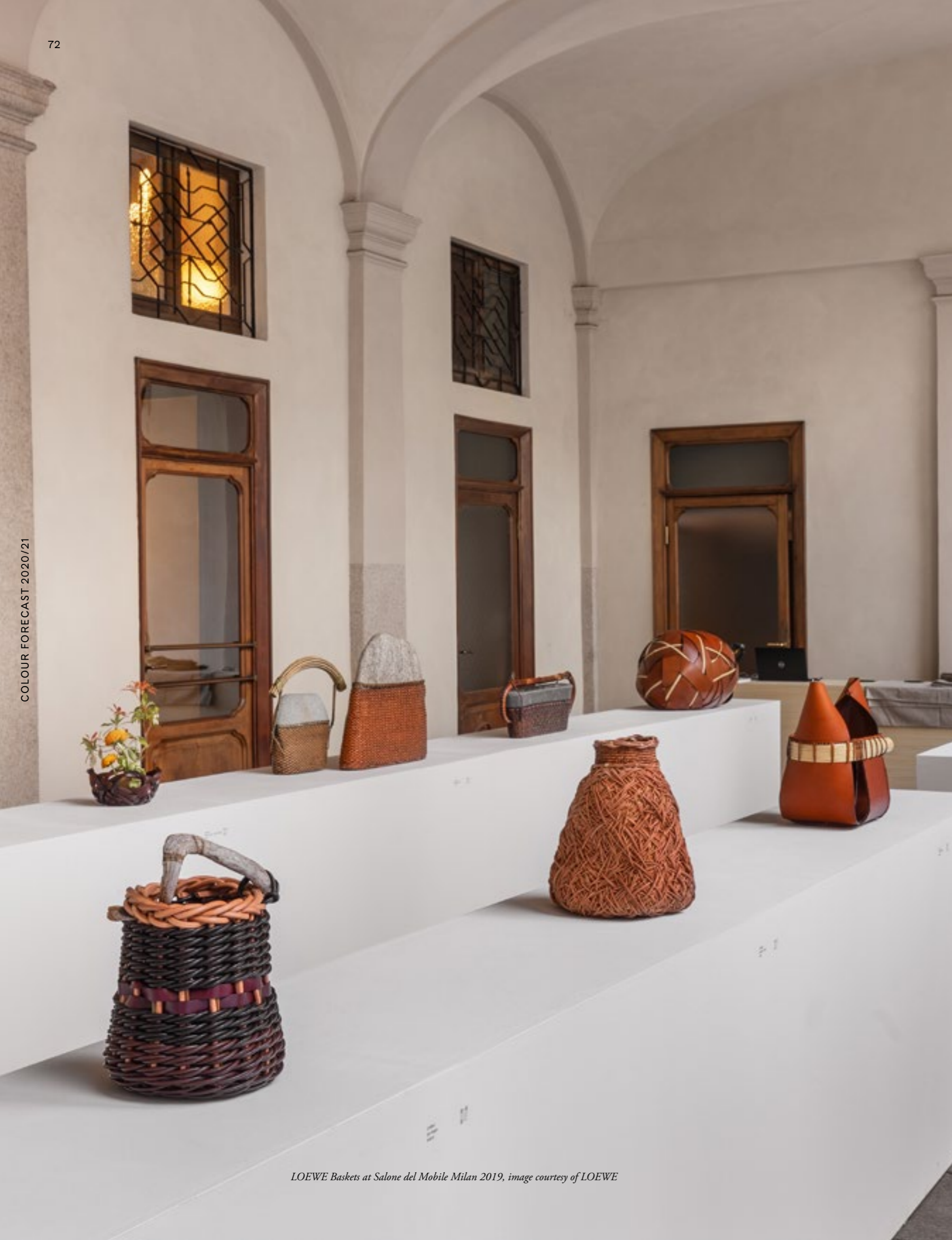
LOEWE Baskets at Salone del Mobile Milan 2019