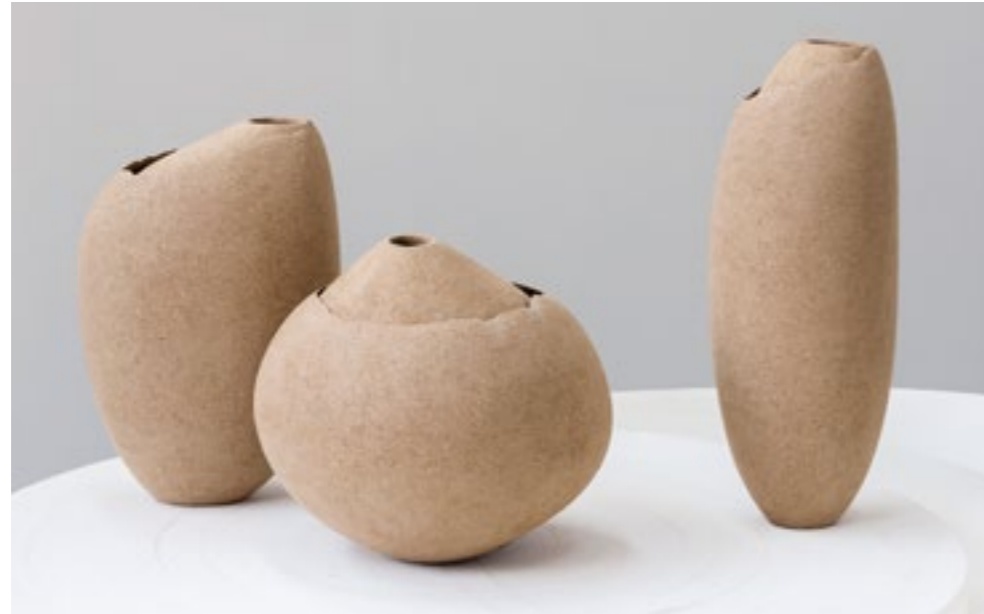
Mantiqueira vases by Tacchini