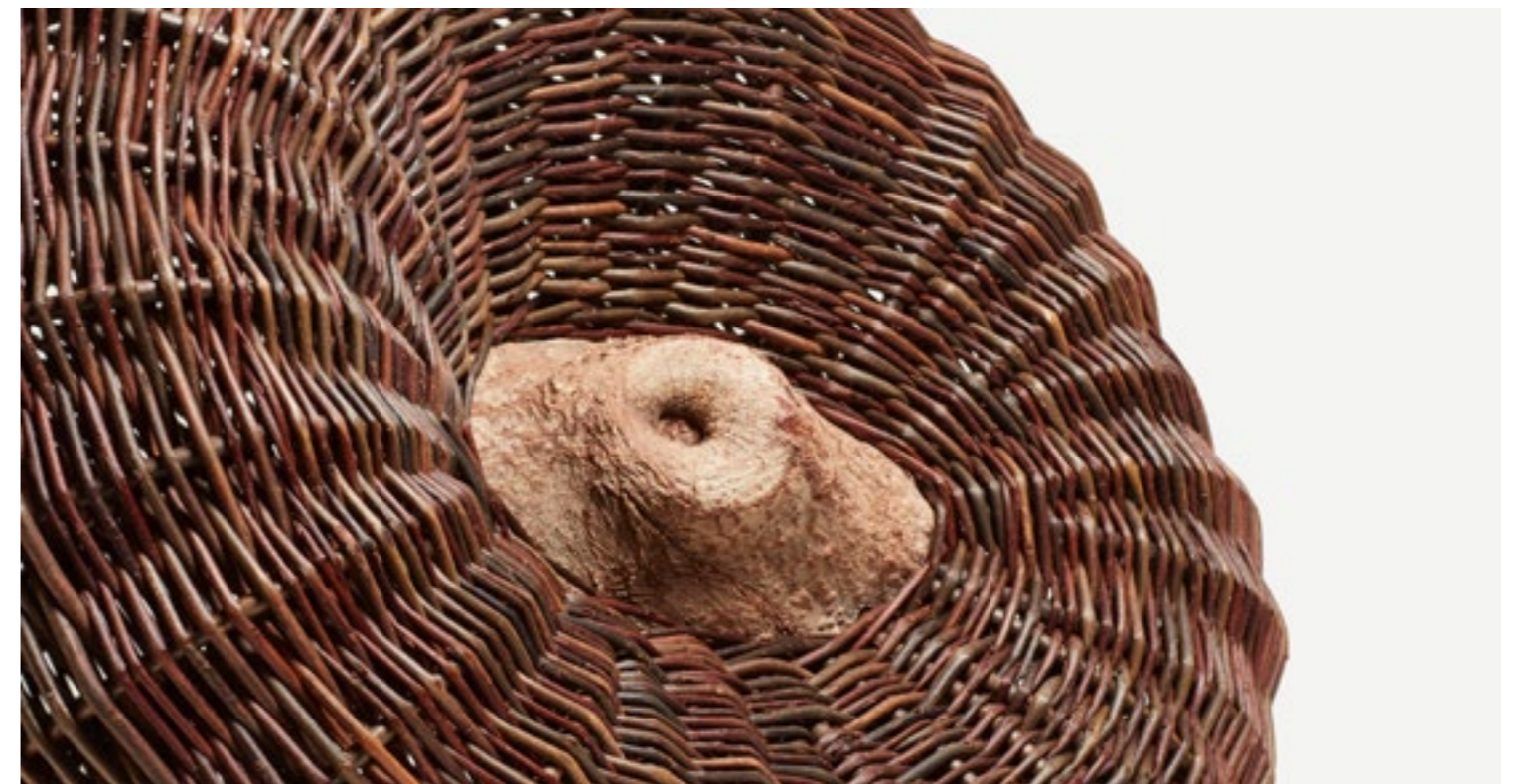
Where the Branch Lived Sculpture by Joe Hogan, image courtesy of The New Craftsmen