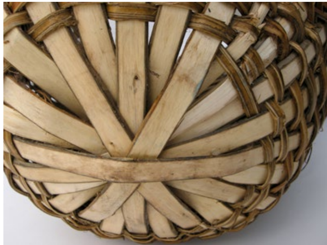
Basket by Hilary Burns